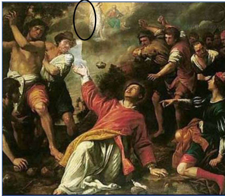
Stoning of the Apostle Steven (note: Jesus standing in background), by Domenico Fiasella, 1589-1669

On the issue of forgiveness, we often hear both from Christian teaching and from experts on health about the adverse effects to the health of a person having unforgiveness and bitterness towards another. They include adverse physical health issues, mental distress, bitterness, depression and unhappiness. Living with the effects of unforgiveness makes it impossible to improve our marriage, and to have a life of joy and freedom in our relationship with God.